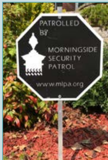
Old Security Patrol Sign