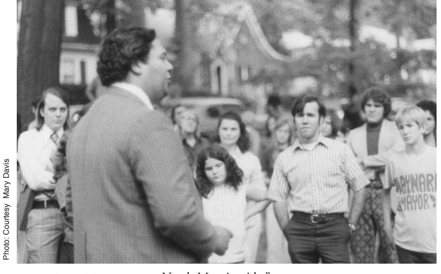
Maynard Jackson addresses an anti-highway rally in Orme Park during the 1973 election for Mayor.

"Maynard understood the power of neighborhoods and was able to cut into the white vote on the issue of the highway."