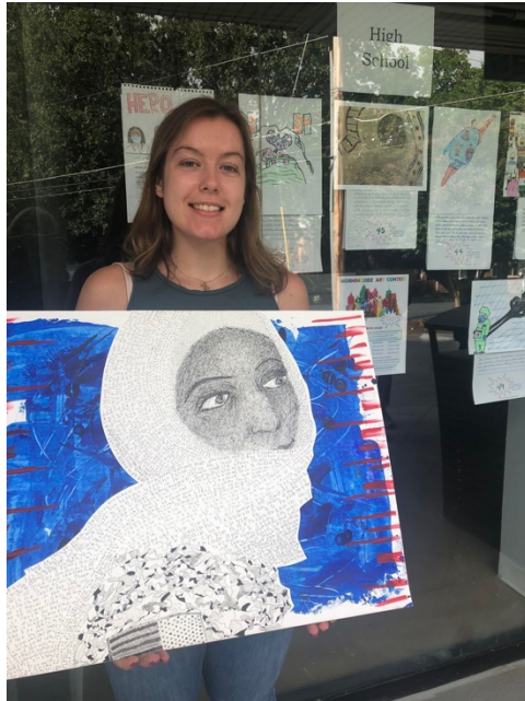
High School Division 1st Place Winner