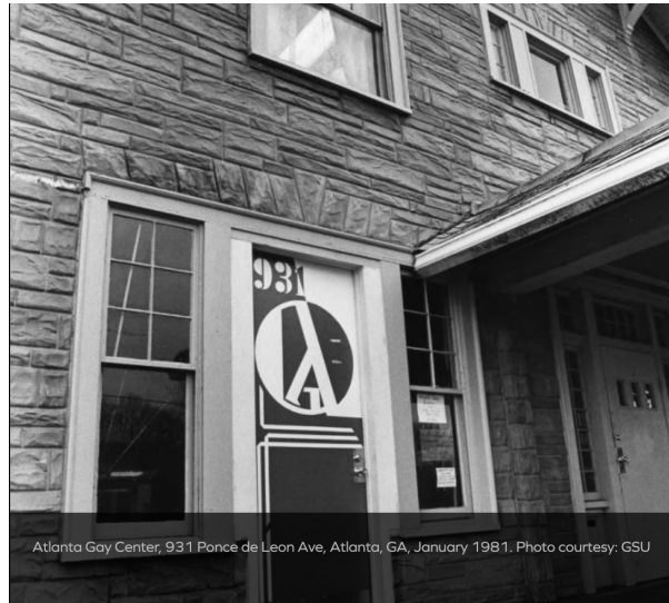
Atlanta Gay Center, 931 Ponce de Leon Ave, Atlanta, GA, January 1981.