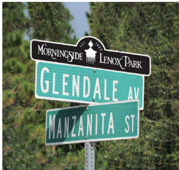
Design for MLP Street Toppers Coming soon to a street near you!

Security is always one of the main concerns of MLPA, so you may see new banners and window decals soon as Sue McHale will be kicking off the Clean Car Campaign over the coming weeks, reminding residents to avoid car break-ins by keeping valuables out of your car.